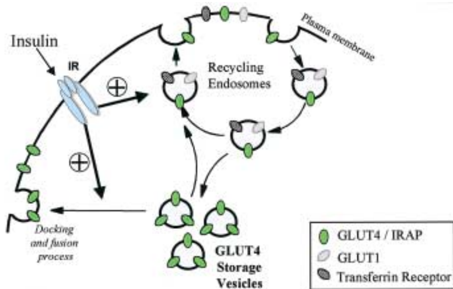
FIG. 1. Possible model by which insulin may stimulate GLUT4 translocation and cellular glucose uptake. GLUT4 is found in both a unique pool (GLUT4 storage vesicles; GSVs) as well as in the recycling endosomes where it co-localises with GLUT1 and transferrin receptors. The GSVs are stimulated to move directly to the surface in response to insulin. Insulin also increases the rate of recycling of the endosomal system.

locating GLUT4 vesicles to the plasma membrane as, unlike in fibroblasts, microtubules are highly fragmented in 3T3-L1 adipocytes and thus unlikely to be capable of playing such a role (Fig. 2).